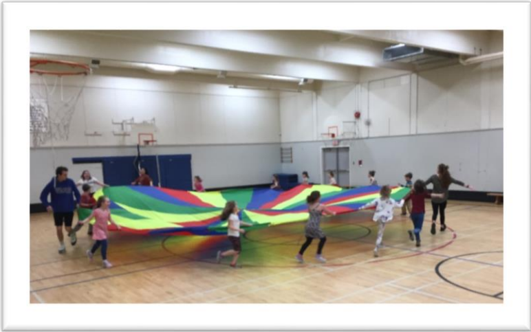
Our last Primary Games took place on Wednesday. Thank you to the COTR students for leading this lunch hour program.